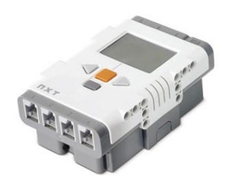
Fig. 3. The Processor Used in Robots.