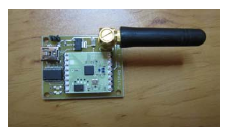
Fig. 4. Wireless Data Emitter Board