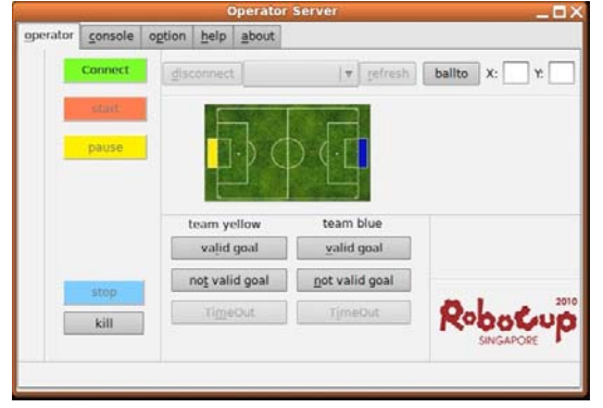
Fig. 5. Visual Operator Module

One of the main experiences that we gained of different competitions was the hardness of using console base operator. So in order to have a more user friendly Operator we had decided to design a new operator with a graphical user interface. In this new Operator we had designed a Button for each one of the main commands and also we kept console mode for those who would like to use console. Also we added graphical drop ball ability so by clicking at the image of the field you can drop ball to your desired position. This module had been tested successfully in RoboCup 2010.