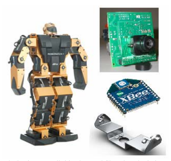
Fig. 4. Devices controlled by the new PCB and mechanical support for CMUCam2.

The devices that can be controlled using the new PCB are presented at Figure 4 that also presents the mechanical support developed in the project.