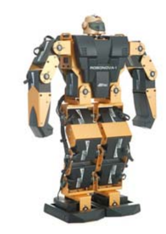
Fig. 1. ROBONOVA-I Humanoid Robot.

The team consists of three ROBONOVA-I Humanoid robot shown in Figure 1, produced by HiTec. The robots present 16 servo motors and an electronic control board MR-C3024 that can be programmed using standard software. However the software is limited and does not allow the introduction of other desirable features for the robot soccer competition.