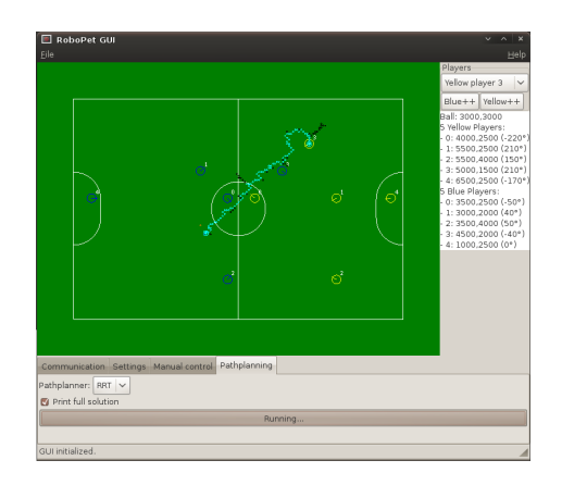
Fig. 2. GUI Screenshot

Due to the new DC-brushless motor - Maxon EC-flat 45 and the desire of having a faster and more efficient hardware able to control the motor velocity and provide a feedback, all the electronics of the robot have been redesigned. With the goal of creating a modular electronics to facilitate possible