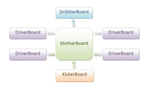
Fig. 3. Electronics Architecture

The Motherboard is responsible for the communication - through radio - of the robots with the main server. The radio was changed to the 2.4GHz transceiver TRW-24G, that helped easing the interference problems faced by the old module. This board receives the displacement, the dribble and the kick vectors and returns the real speed, the ball's presence in front of the robot and the charge level of the batteries.